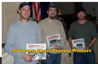
Autox Street Touring Winners