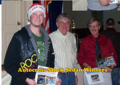
Autox Stock Sedan Winners