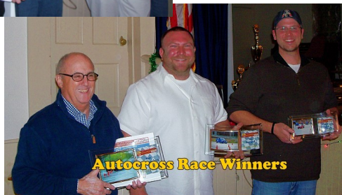
Autox Race Winners