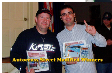
Autox Street Modified Winners