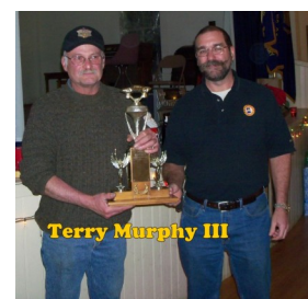
Bob Heath Trophy