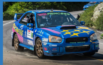
Margaret Sharron - 7:27:87 2004 Subaru WRX STI