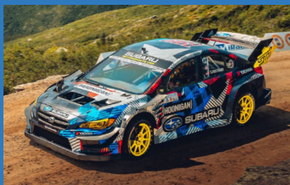
Travis Pastrana - 5:28:67 2020 Subaru WRX STI